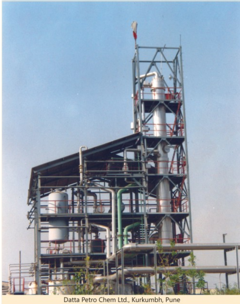
Datta Petro Chem Ltd., Kurkumbh, Pune